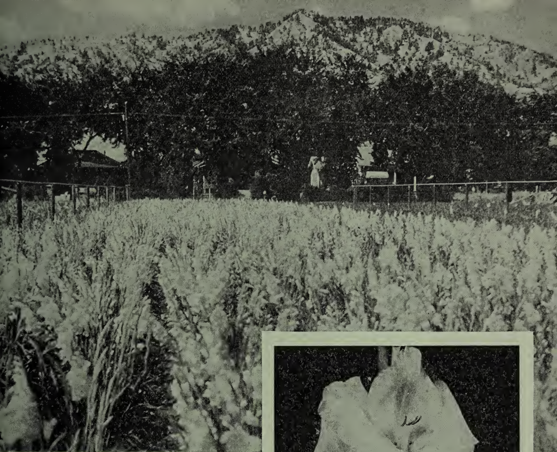
One of my fields of RED PHIPPS Glads at the foot of the Rockies.